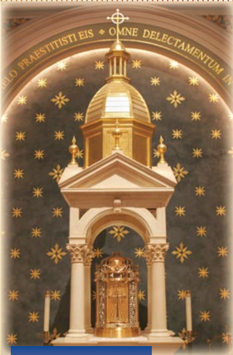
Tabernacle Tower, Cathedral of the Blessed Sacrament, Sacramento, California