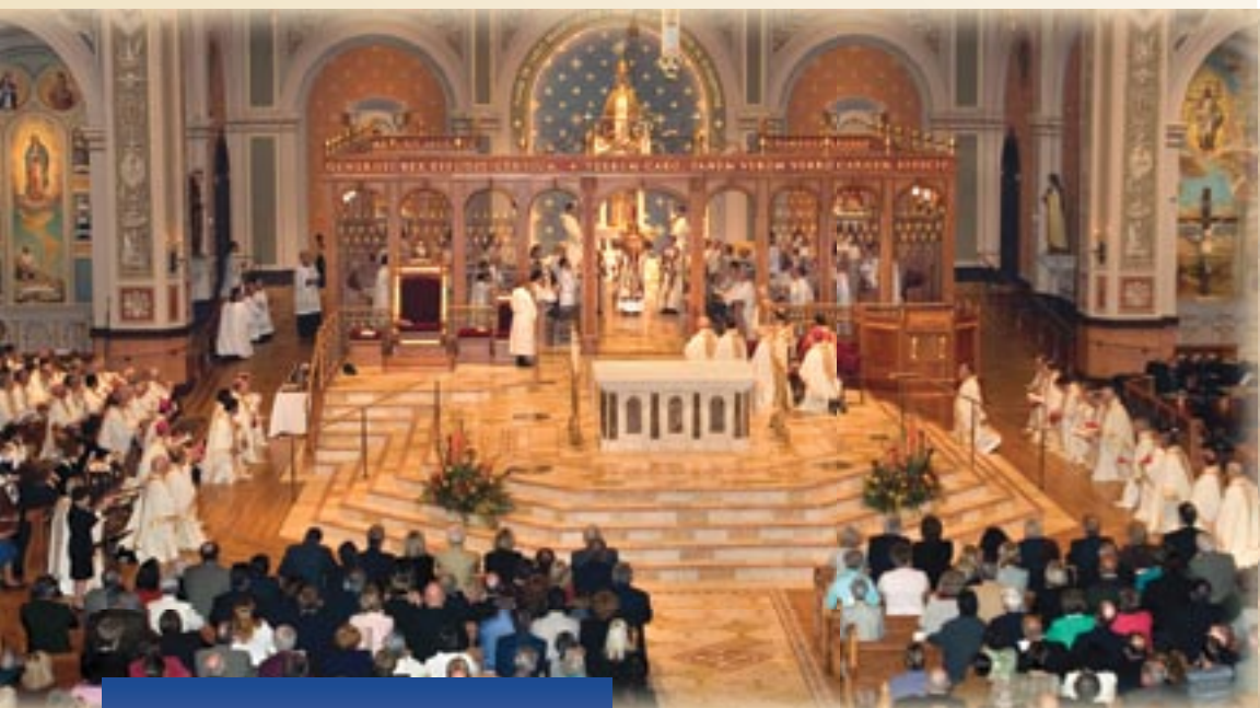
November 2005 Rededication of the Cathedral of the Blessed Sacrament, Sacramento, California