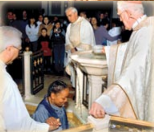
The crucifix and crown, Cathedral of the Blessed Sacrament; (inset photo) Rite of Christian Initiation in Cathedral baptismal font