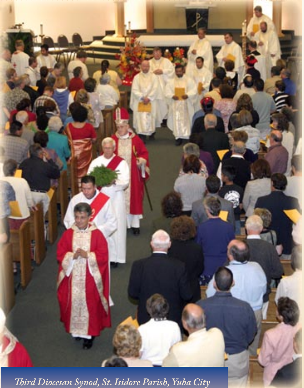
Third Diocesan Synod, St. Isidore Parish, Yuba City