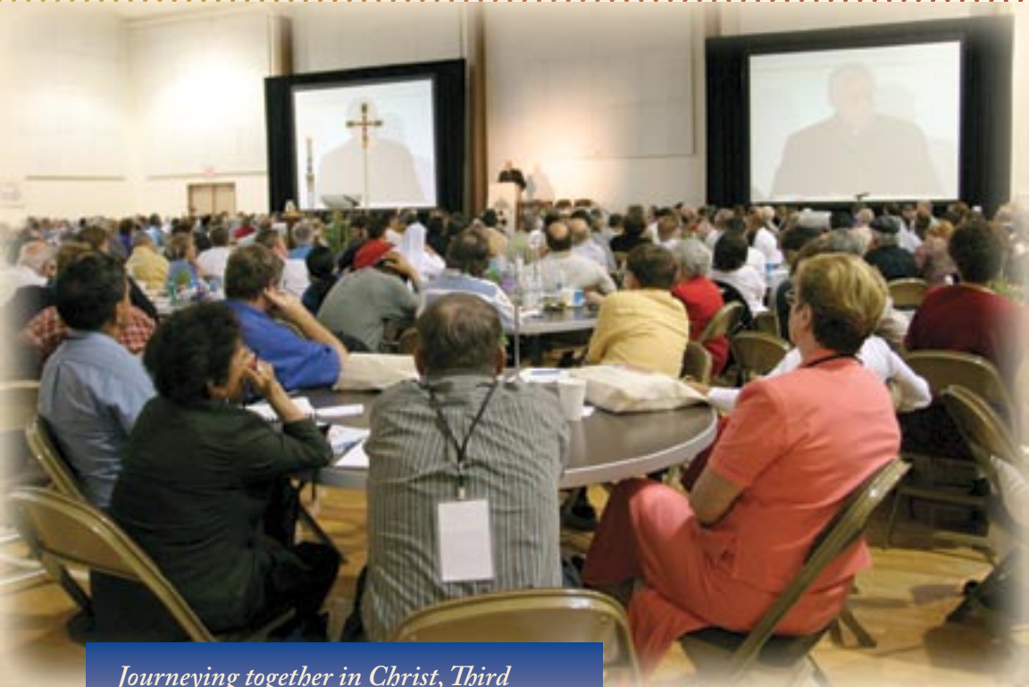
Journeying together in Christ, Third Diocesan Synod, October 2004 Session