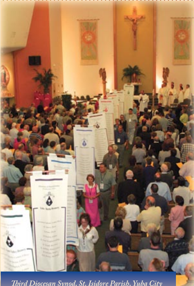
Third Diocesan Synod, St. Isidore Parish, Yuba City