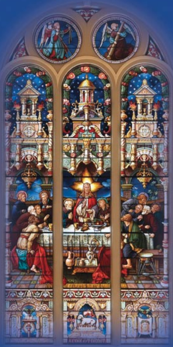
The Last Supper, Cathedral of the Blessed Sacrament